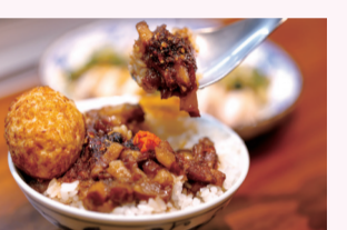
Braised Pork Rice